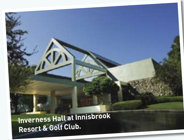
Inverness Hall at Innisbrook Resort & Golf Club.

A recent study by Oxford Economics shows that for every dollar invested in business travel, businesses experience an average $12.50 in increased revenue and $3.80 in new profits. Cuts in business travel, however, have