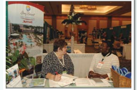
Face-to-face meetings are vital to increase business.

local business owners can continue to grow our state’s share in the meetings and conventions industry and help Florida’s economy recover and prosper.